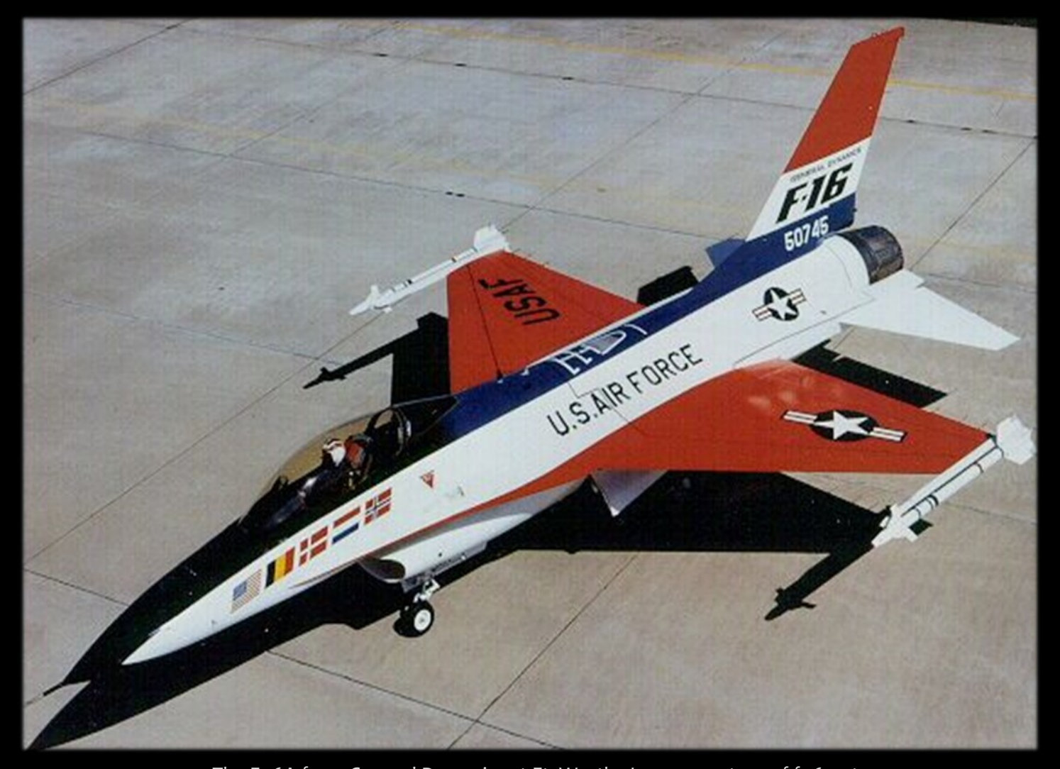
The F-16A from General Dynamics at Ft. Worth.

There's a famous saying "when the student is ready the teacher will appear". You also see that paraphrased as "when the teacher is ready, the student will appear". To me, this emphasizes the symbiotic relationship of the mentor with the mentee.