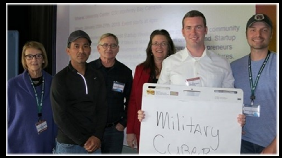
The author (3d from the left) on "team MCPA" led by its founder (2nd from the right) at Start-Up Weekend, Monterey Bay 2013.

Certainly, one of the more important functions of a "Professional Association" such as ours is to form a "Community" that not only supports its members in being successful in their careers, but also fosters finding, expressing, and passing along the important technologies, career lessons, and values of people engaged in a worthy activity to serve not just themselves and each other, but our larger community of fellow citizens.